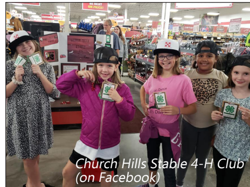
Church Hills Stable 4-H Club (on Facebook)