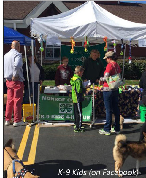
K-9 Kids (on Facebook)