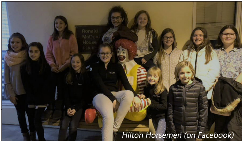
Hilton Horsemen (on Facebook)