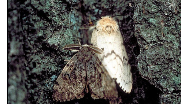
Male (darker, left) & Female (lighter, right)

Males are strong fliers and may be seen flying in a zigzag pattern during the daytime. The female does not fly, but remains near the pupation site and releases a sex attractant (pheromone) which attracts males. After mating, she deposits her eggs in a single mass and then dies. There is one generation per year.