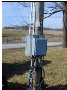
Pole Mounted Farm Transfer Switch

There are two considerations for transfer switches for household use. If only selected circuits will be energized by the emergency generator, then those circuits can be wired through a small transfer switch. If the entire house will be energized, then a transfer switch rated for the service size must be used. Your generator supplier can help you select and install the appropriate device to maintain proper operating safety.