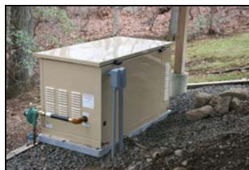
Permanent Household Generator Installation

Permanent household generators are usually installed outdoors in a specially designed shelter that provides weather protection and adequate ventilation while the unit is operating. If a portable generator is used, it should be wheeled to a location near the house service entrance where a lead from the transfer switch can be attached to the generator output. The portable generator should be properly grounded, using the grounding tap provided on the generator control box. Never operate the portable generator in the basement or garage. The carbon monoxide produced by the engine is deadly.