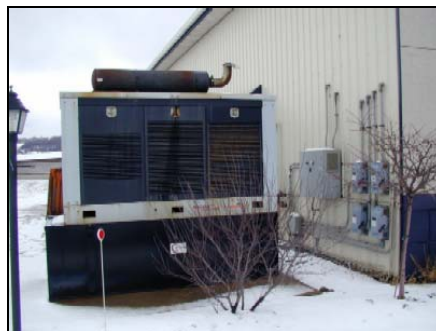
Large Permanent Installation

Emergency generators are driven either by a tractor PTO or by their own self contained gasoline, diesel or LP fueled engine. Tractor PTO generators are set up and operated manually during an electric power outage. Engine driven generators can be manually operated or set up to automatically start and operate when an outage occurs. Automatic emergency generator systems are much more expensive and manual systems because of the automatic transfer switching and required safety devices. Such systems are usually specified when there are critical power needs such as poultry house ventilation or human life support systems.