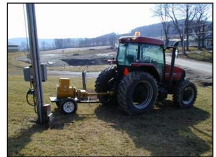
PTO Powered Farm Generator Ready for Service

manual units or as quite sophisticated, fully self-contained automatic units. One key