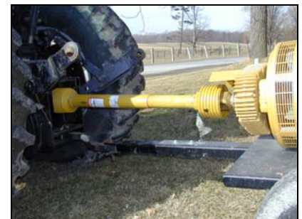
Properly Shielded Generator PTO Shaft

for easy movement to the point of use. The transfer switch on a farm is often located on the meter pole with a heavy power code used to connect the switch to the generator. The tractor and generator are parked and run at that location for the duration of the outage. An open, canopy structure can be placed over the generator to protect it from the weather while it is in use. Care must be taken to be sure the generator is stable and cannot tip. The tremendous force created within the generator as large loads are turned on can cause an unstable generator to flip over. The PTO shaft used for the generator should always be stored with the generator, and it must be properly shielded for safety so that the operator can't get entangled when it is spinning.