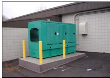
Large Permanent Generator Located Outside

plumbed to the outside and a wall fan is usually installed to provide extra ventilation.