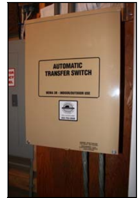
Household Automatic Transfer Switch

There are two considerations for transfer switches for household use. If only selected circuits will be energized by the emergency generator, then those circuits can be wired through a small transfer switch. If the entire house will be energized, then a transfer switch rated for the service size must be used. Your generator supplier can help you select and install the appropriate device to maintain proper operating safety.