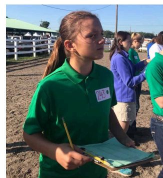
Youth at the Region 2 Horse Program and Hippology contest. They started at 8am with horse judging and kept going for 5 hours. Topics included anatomy, breeds, knot tying, farrier tools, and more!