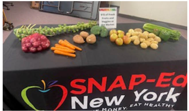
$ 15 dollars' worth produce at the Rochester Public Market

During this exciting check presentation, Nutrition Educators were able to showcase the amount of produce that someone can purchase at the Rochester Public Market versus a retail store using the 15-dollar vouchers that participants receive after each class.