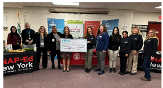
Media Event and group photo.