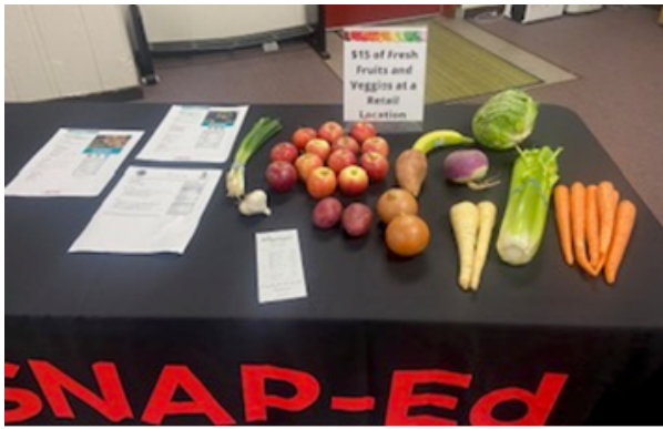
$15 dollars' worth produce at a Retail Store